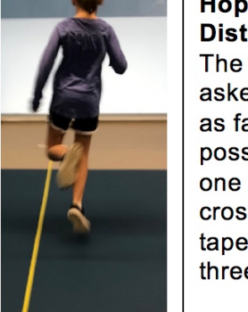
Timed Hop The Subject is asked to hop, as quickly as possible, on one foot for a distance of 6